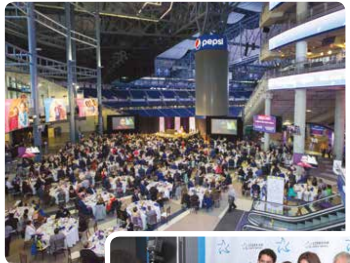
ABOVE: 2019 Gala memories.